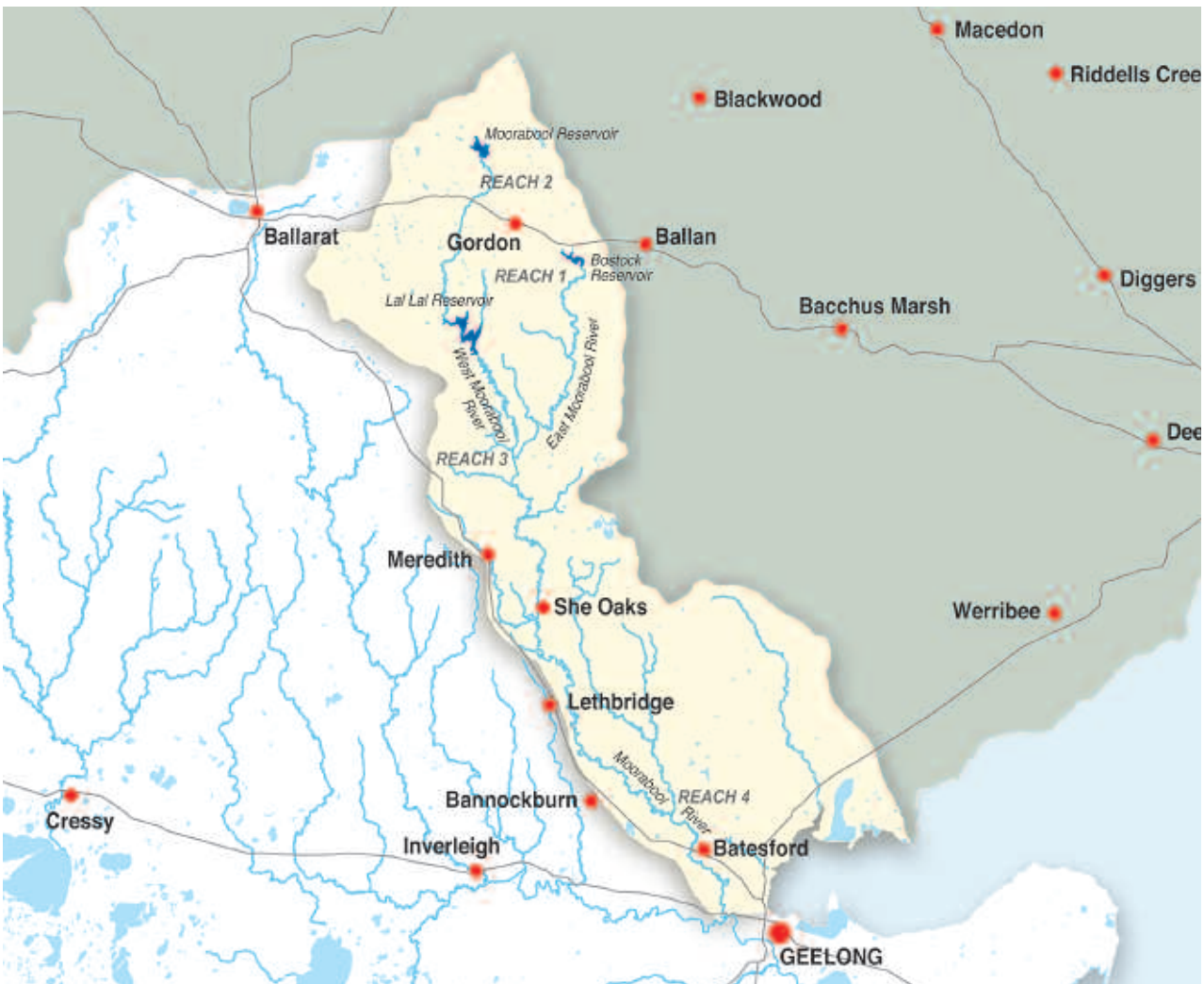
Figure 1: The Moorabool River Catchment

Twelve native freshwater fish species have been recorded in the Moorabool River system. One species, the Australian Grayling, is listed as vulnerable in Victoria, under the Flora and Fauna Guarantee Act 1988 and is listed as vulnerable under the Commonwealth Environment Protection and Biodiversity Conservation Act 1999 as well as being on the 2002 International Union for the Conservation of Nature Red List of Threatened Species. Australian Grayling have become extinct in a major part of its range which is attributable to the construction of dams and weirs restricting fish migration to estuarine waters, as well as the alteration of natural stream flow and temperature regimes. Five other migratory fish have been recorded in the Moorabool River.